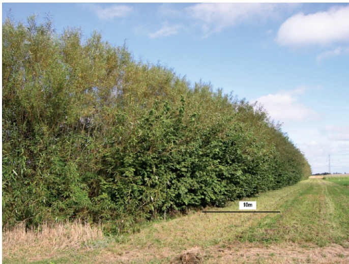
Figure 3. An external view of one of the biomass energy rows and part of the accompanying food crop area within the CFE system at the University of Copenhagen, Denmark.

multifunctional cropland as being one that we can compare with the more detailed “bottom-up” estimate made by using the second, field-based, method that is described below.