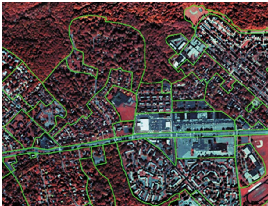
Figure 1 Patchiness in the Rognel Heights neighborhood of Baltimore, Maryland. The spatial heterogeneity of urban systems presents a rich substrate for integrating ecological, socioeconomic, and physical patterns using Geographic Information Systems. The patch mosaic discriminates patches based on the structures of vegetation and the built environment. The base image is a false color infrared orthorectified photo from October 1999. (M.L. Cadenasso, S.T.A Pickett & W.C. Zipperer, unpublished data.)