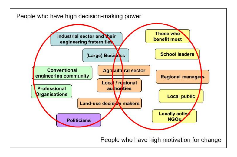
Fig. 3. Potential target groups to be informed about benefits of ecological engineering practices

It was agreed, that the best way to communicate the benefits of ecological engineering practices is through well-working demonstration projects. That was the purpose of the establishment of the journal Ecological Engineering [10] in 1992. The journal, which currently publishes about half of the more than 400 manuscripts it receives annually has published many case studies (as well as scientific studies of ecological engineering) to establish a major peer-reviewed "data base" of successful (and unsuccessful) ecological engineering approaches. New authors are required to cite at least 3 papers already published in the journal to enhance the learning experience of ecological engineering. The International Ecological Engineering Society is building up a web-based case study collection for a broad range of users and encourages all ecological engineers to contribute their project descriptions via a template